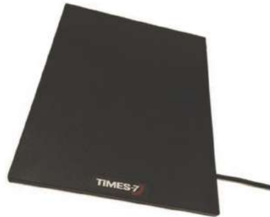
The SlimLine B6031

Proven in a diverse & growing range of markets, applications include: retail & customer interaction, conference & people tracking, race timing, baggage handling, and logistic & supply chain asset management.